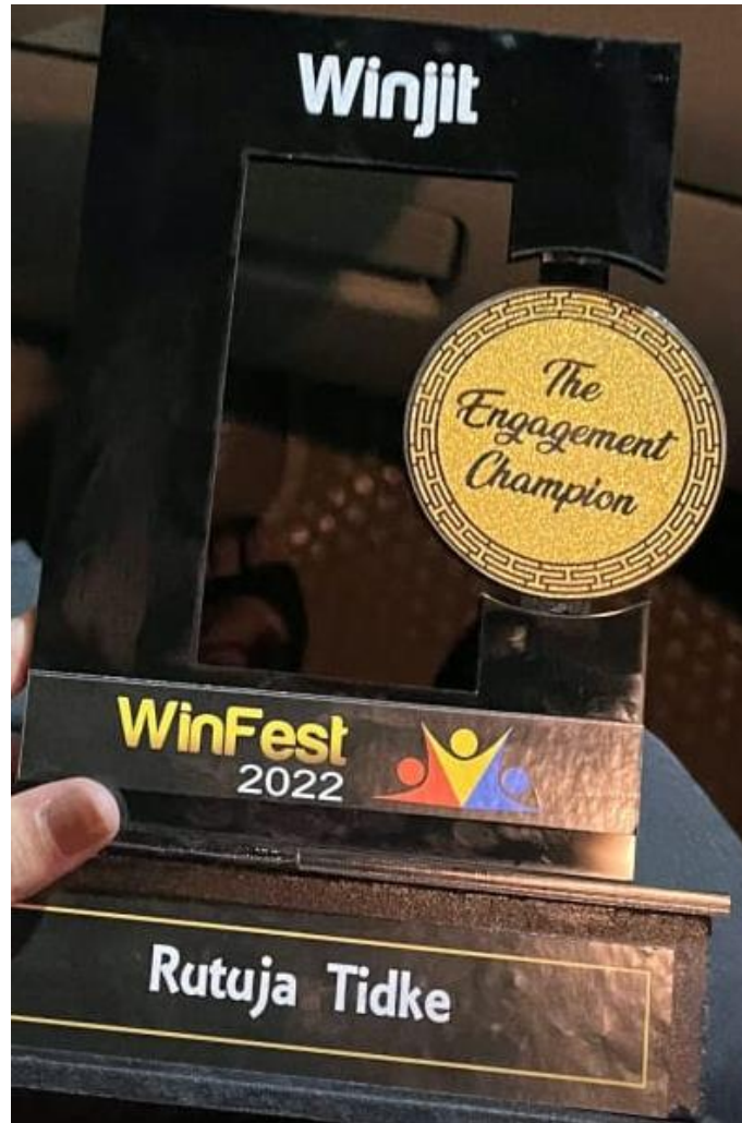
AWARD BY WINJEET TECHNOLOGIES.