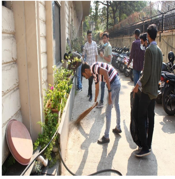
Swatchta at College Campus by ISR cell Ecorangers