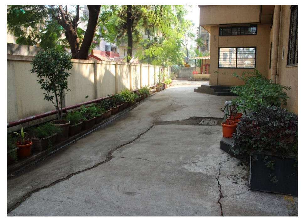
After swatchta abhiyan clean campus