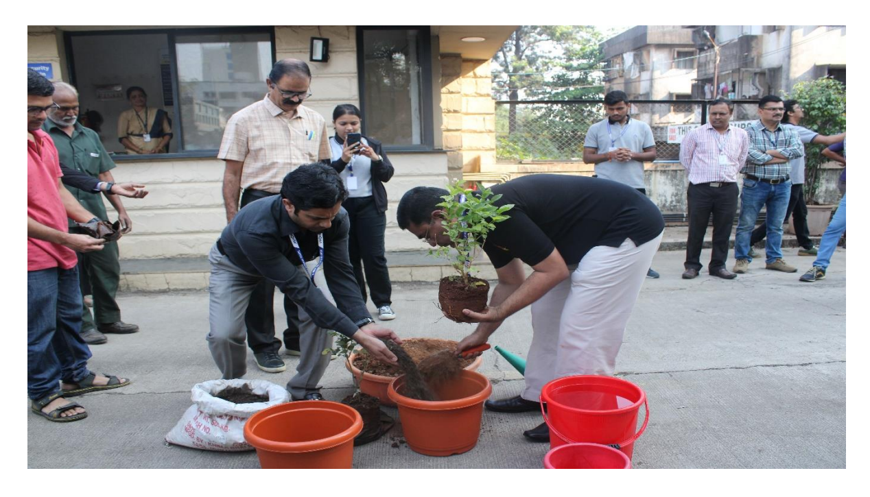
Green Campus sapling planting at the hands of Administrator-AEF