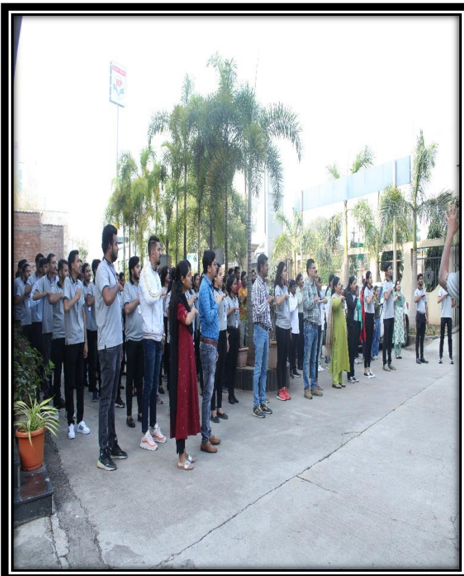
Pledge for Swachta Abhiyan