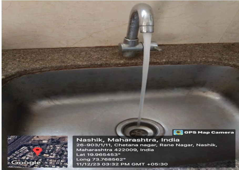
Wash basin at kitchen