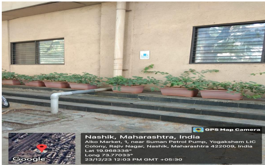
Rain water supply to ground